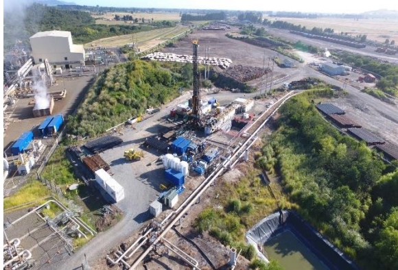
Improvements to the clean-steam plant

Successful well maintenance and work-overs at KA47 and KA27