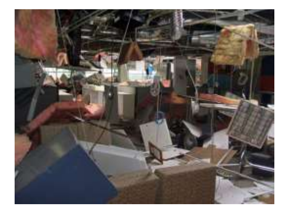
Figure 2: Meridian Manchester Street Offices