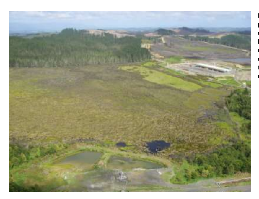
Figure 4: The new Ngawha power station is shown centre right. Extensive bogland in the foreground is protected under QEII open space covenant and the environs are actively managed by the company.